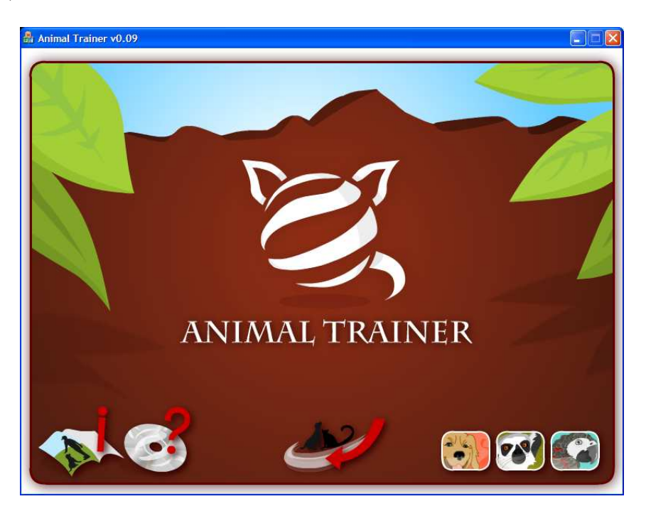
Figure 1: Startup window

Start the game by executing file "AnimalTrainer.exe". A startup window opens (Figure 1)