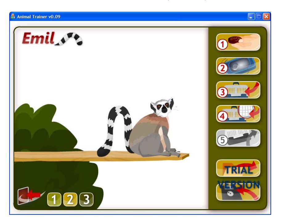
Figure 4: Lemur training window 2

button 2 in the lower left part of the lemur training window 1. Lemur training window 1 changes to Lemur training window 2 (Figure 4).