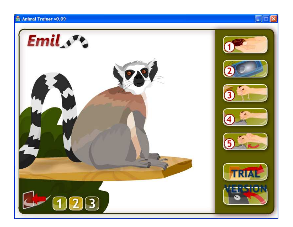
Figure 3: Lemur training window 1