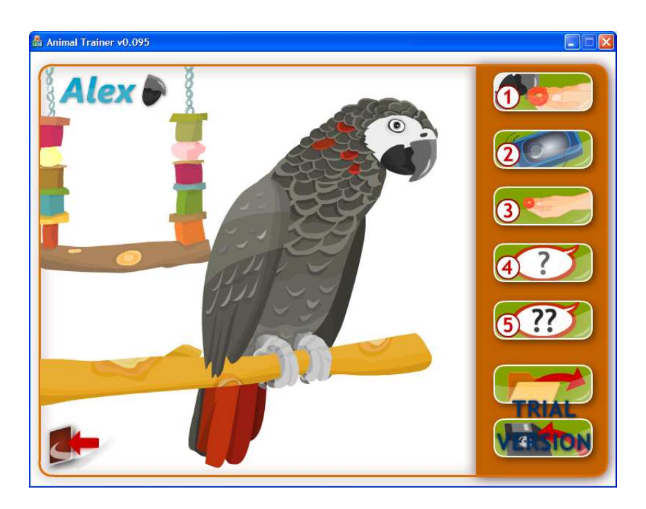
Figure 6: Parrot training window