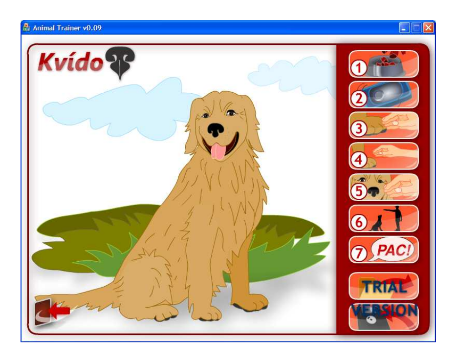
Figure 2: Dog training window