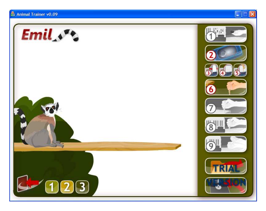
Figure 5: Lemur training window 3

After the lemur has learned both behaviors (pulling the string and entering into the transportation box) you can put them together into the behavior chain. Click on the button 3 in the lower left part of the lemur training window 2. Lemur training window 3 appears (Figure 5).